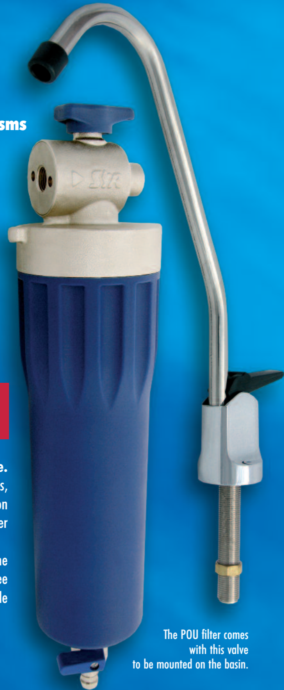
The POU filter comes with this valve to be mounted on the basin.